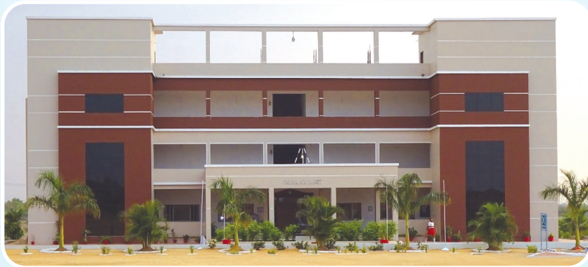
Salma Ali Block